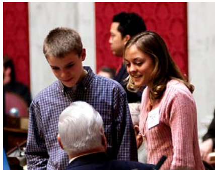
Students enjoy memorable experiences as pages for the West Virginia Legislature. Photo from the West Virginia Legislature website.

To be eligible for the Senate Page Program, students must be ages 12-18; for the House Page Program, students must be in grades 5-12. For information on how to become a page, please contact: