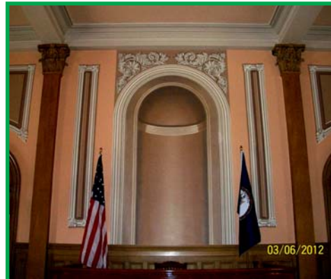
Independence Hall Courtroom – the wall behind the judge's desk.

Visitors will now be able to see a roughly 20-foot-by-20-foot section of wall featuring the original "trompe l'oeil" as well as pencil cartoons of animals that the original artist painted above the main entrance to the courtroom.