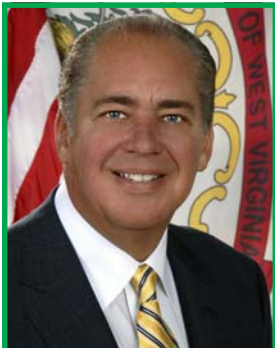
Governor Earl Ray Tomblin