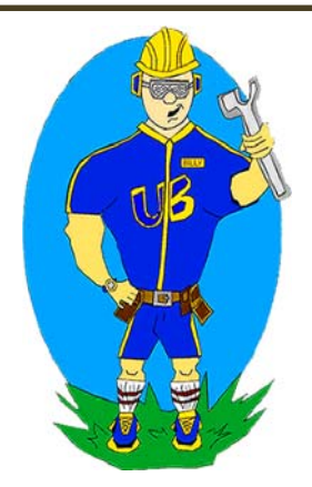
Utility Billy is available at the Public Service Commission's website to help children enjoy learning how to become Utility Superstars!

If you have young children or grandchildren and are looking for something both fun and educational for them, join them on the com-